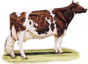
Red & White